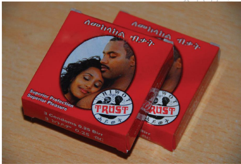
Fig 4.2 The youth can control and prevent HIV AIDS by using condoms

In schools, mini-media and anti-HIV/AIDS clubs are also important forum for information transfer, communication and experience sharing among the youth. These are well placed to reduce and avoid the social stigma and discrimination that make suffer people affected with HIV/AIDS.