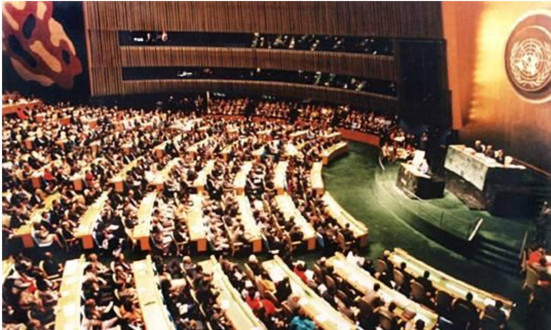
Fig 4.4 The UN General Assembly