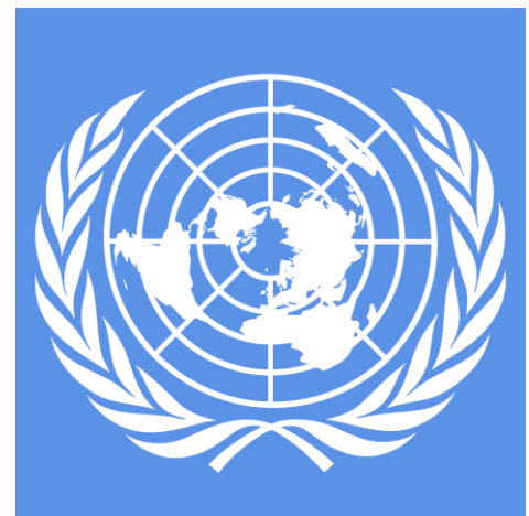
Fig. 4.6 UNO Flag

The Trusteeship Council consisted of an equal number of nations administering trust territories and nations not administering trust territories. Decision required a simple majority. This organ has completed its function and officially suspended because of the independence of all countries of the world.