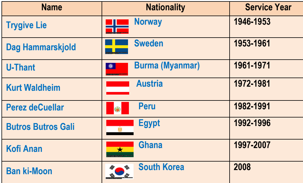
Table 4.2 UN Secretary Generals