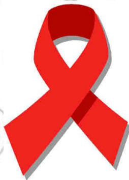
Fig 4.1 The Red Ribbon