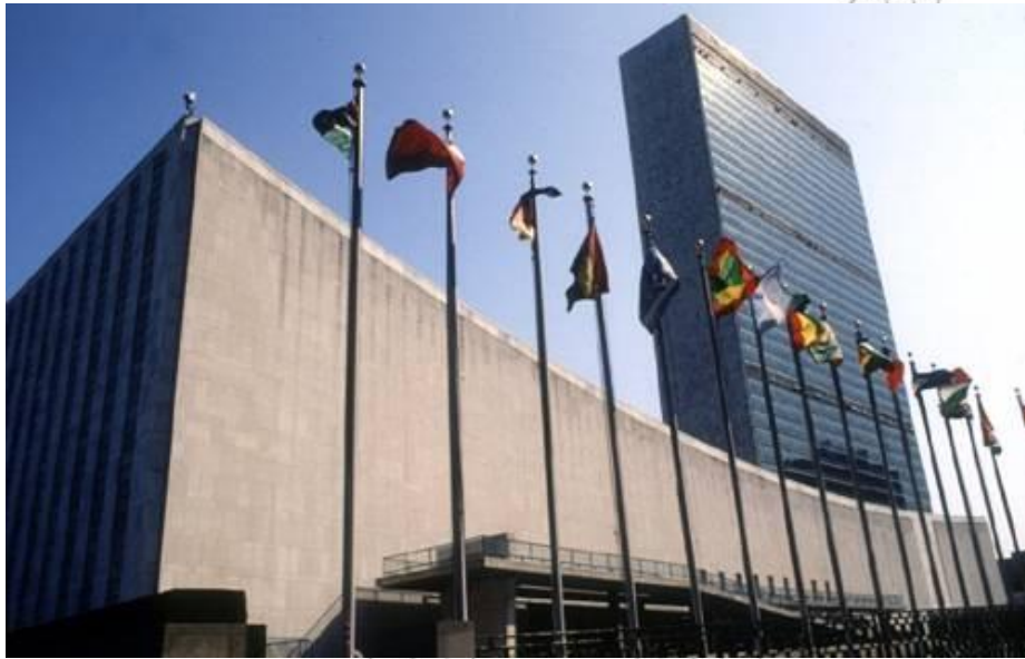
Fig 4.3 UN Headquarters in New York

The headquarters of the UN is in New York, USA. Membership is open to all peace loving nations which accept and carry out the obligations contained in the Charter and are willing to accept the decisions of the organization.