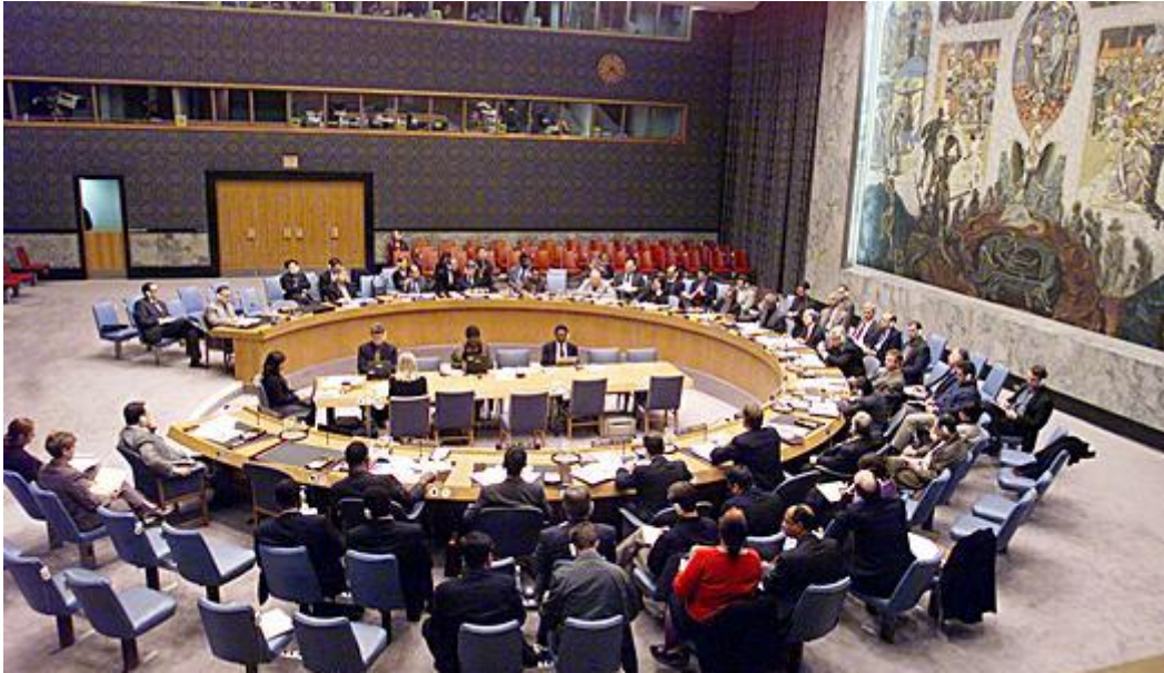
Fig 4.5 The UN Security Council in session